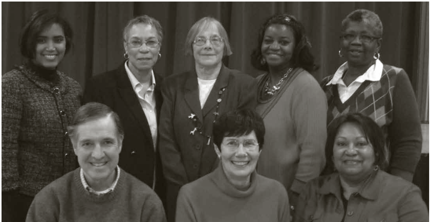
Pictured front row left to right: